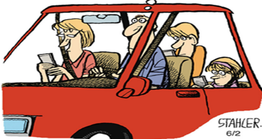
©Jeff Stahl/Distributed by Universal Uclick for UFS via CartoonStock.com

ROAD TRIPS ARE GETTING LONELIER & LONELIER.