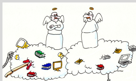
CLOUD COMPUTING "I'd prefer it if they stored their stuff someplace else!"

For example, Google is a massive, free cloud application – the power required to search billions of web sites and content in seconds and deliver the relevant results to your screen far exceeds the capacity of your PC. Facebook is another free cloud application that allows you to post pictures and connect with your friends in real time without having to install any software on your computer. Of course, there are also applications such as Salesforce, Constant Contact, SurveyMonkey, etc., that you pay to use. It is quickly becoming unnecessary for some businesses to purchase and maintain an on-site server. Now companies can host one or more of their applications, data, e-mail and other functions "in the cloud." That simply means it's stored off-site in a highly secure, high-availability "utility" company that has far more power and resources than you could ever logically have on-site as a small business. And with devices getting cheaper and Internet connectivity exploding, cloud computing is suddenly a very smart, viable option for some small business owners